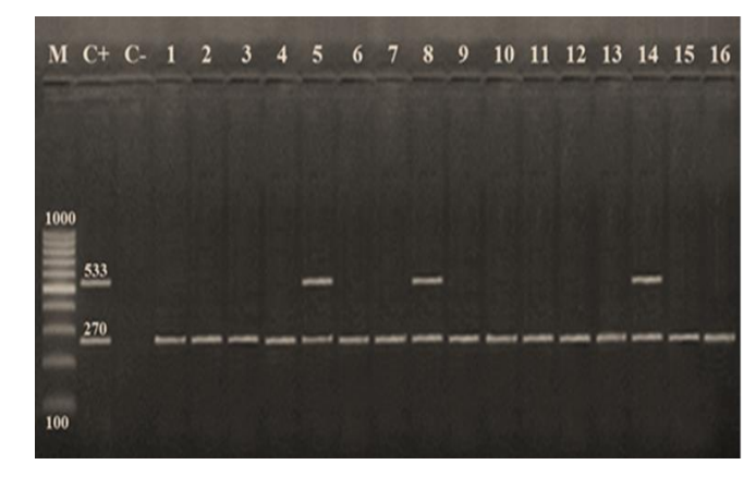
Figure 3. Agarose gel electrophoresis for multiplex PCR products of thermonuclease ( nuc ) (270 bp) and methicillin ( mecA ) (533 bp) virulence genes of isolated S. aureus . Lane M: A 100 bp DNA ladder marker; Lane C+: Control positive S. aureus strain for nuc and mecA genes; Lane C-: Control negative; Lanes from 1 to 16: Positive S. aureus strains for nuc gene; Lanes 5, 8 & 16: Positive S. aureus strains for both nuc and mecA genes.